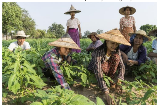
Cultivation of sesame to reduce poverty in Magway